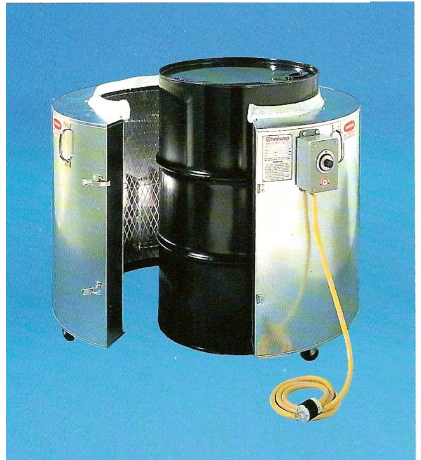
30 GALLON DRUM HEATER