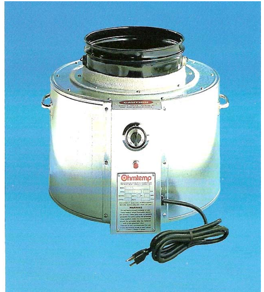
5 Gallon Pail Heater